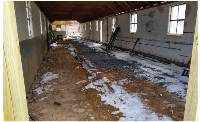
Raising of the rafters