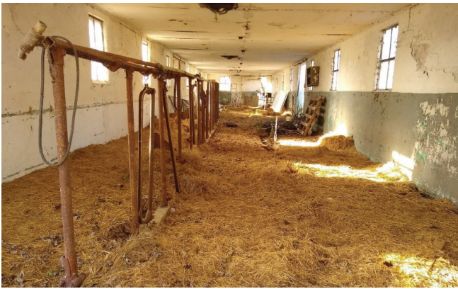
Tabler Farm old milk parlor interior before renovation