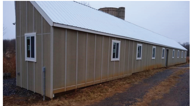
The exterior of the building is much improved!

Currently, construction of an aquaponics system is underway. Shepherd has obtained two donated tanks (1,500 gallons each), settlers, pumps, and biofilters from the Freshwater Institute, USDA Cool and Cold Aquaculture Center, USGS, and the West Virginia