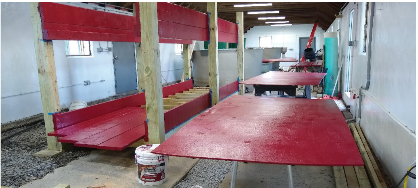
Progress on one of the two deep-water aquaculture growing beds. Behind the two growing beds are the tanks; not seen are the sediment filters, biofilters, and oxidation tank. In the front bottom of the picture is the platform for the vertical growing system.

Department of Natural Resources. Construction of the Aquaponics Laboratory would not have been possible without the assistance from the President's Club and the ground work it provided on the building improvements.