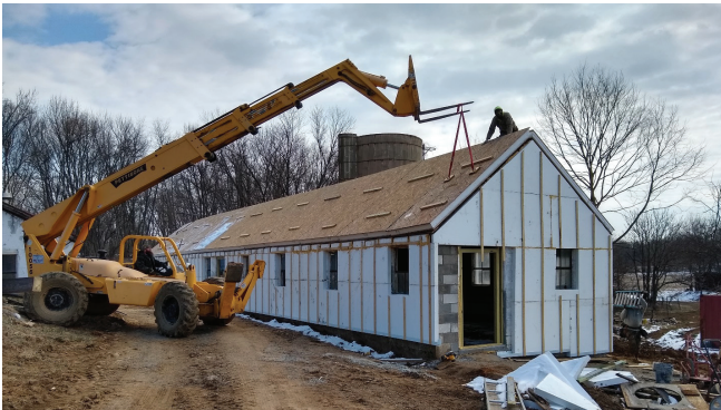
Installation of the insulation outside